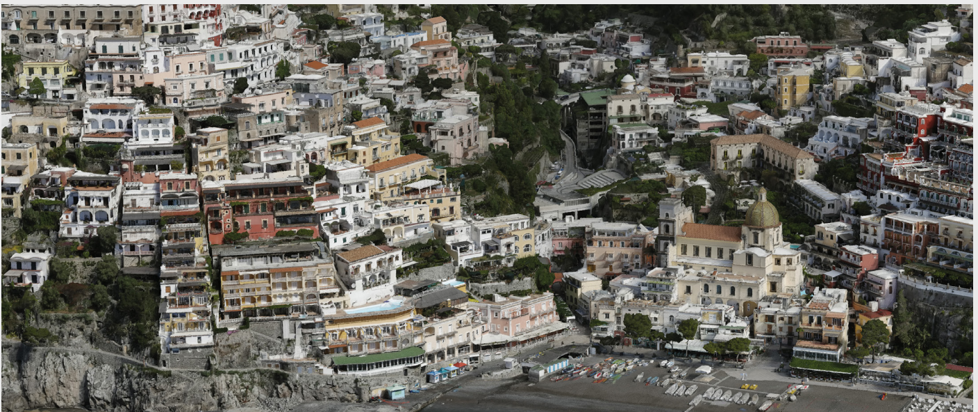
3D model of the city of Positano mapped in 4G.

Inspection: buildings, infrastructures, telecom towers, wind turbines, solar panels, pipelines, refineries. Photogrammetry: mapping, surveying, 3D modeling, orthophotography. Construction monitoring, automated surveillance, real estate, insurance, video creation.